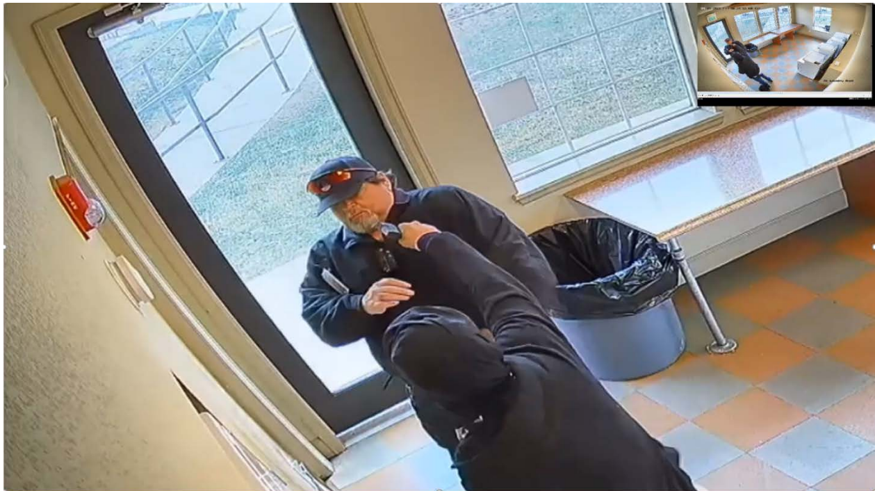
Surveillance image from the Reserve Apartment Complex laundry room.