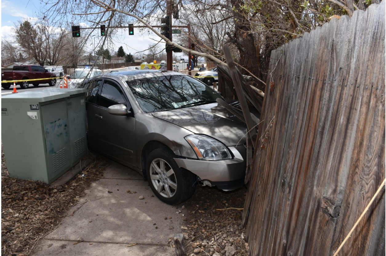
Image of Nissan Maxima crashed into fence near intersection of East 115 th Avenue and Colorado Blvd.